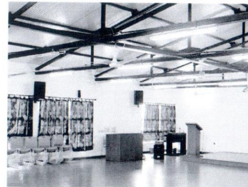
NSH Recreation Room

With its high emphasis on overall development of students, Nursing students' hostel provides opportunities for students to utilize their leisure time in an enjoyable and beneficial manner. There is a recreation hall with television and Piano. Indoor games as caroms and chess are available. A sports ground with volley ball, throw ball, Badminton and Basket- ball court is a boon for sports lovers. Various celebrations and programs as College Day, Hostel Day, Talent nights, Sports day, graduation Day provides umpteen opportunity for students to portray your talents and channelize their energy.