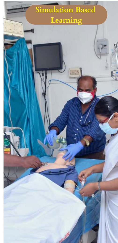
Simulation Based Learning