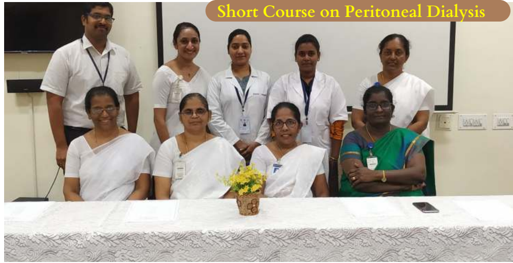
Short Course on Peritoneal Dialysis

Recognized by the Indian Nursing Council & Affiliated to the Tamil Nadu Dr. MGR Medical University, Chennai, Tamil Nadu