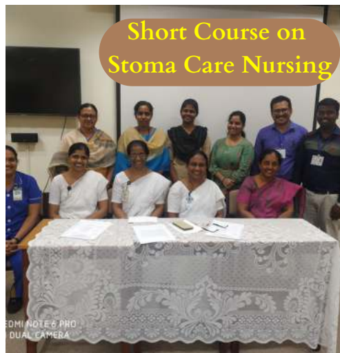
Short Course on Stoma Care Nursing