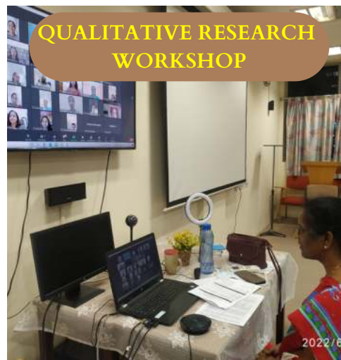
QUALITATIVE RESEARCH WORKSHOP

Vellore, Tamil Nadu, India W4HR+GG5, Thottapalayam, Vellore, Tamil Nadu 63204 Lat 12.928292° Long 79.141882° 13/04/22 02:31 PM