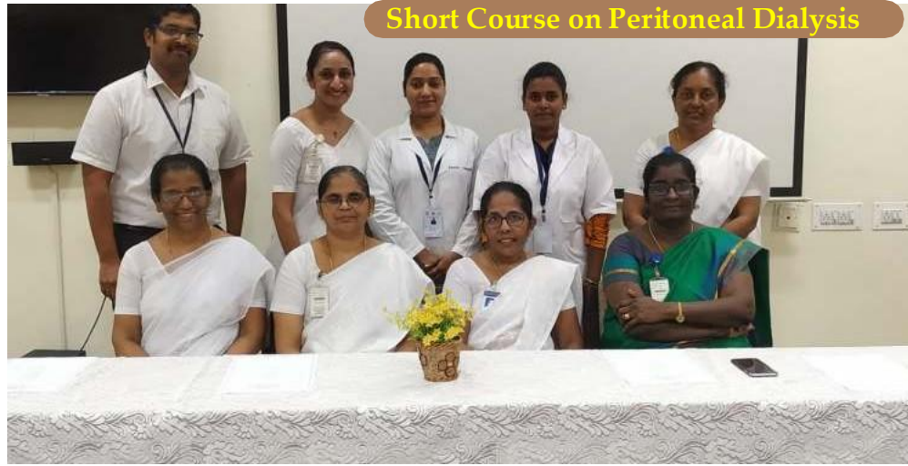
Short Course on Peritoneal Dialysis

Recognized by the Indian Nursing Council & Affiliated to the Tamil Nadu Dr. MGR Medical University, Chennai, Tamil Nadu