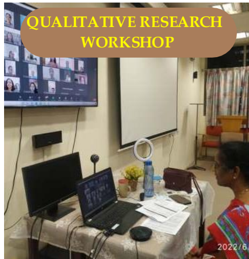
QUALITATIVE RESEARCH WORKSHOP

Vellore, Tamil Nadu, India W4HR+GG5, Thottapalayam, Vellore, Tamil Nadu 63201 Lat 12.928292° Long 79.141882° 13/04/22 02:31 PM