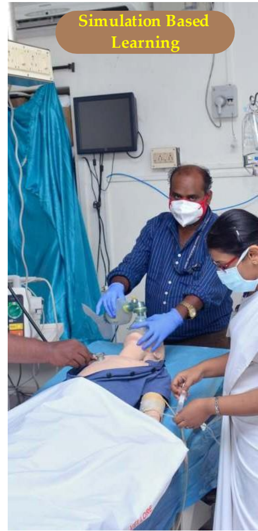
Simulation Based Learning