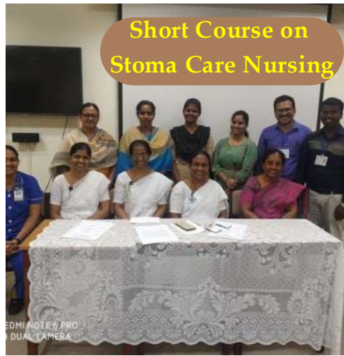
Short Course on Stoma Care Nursing