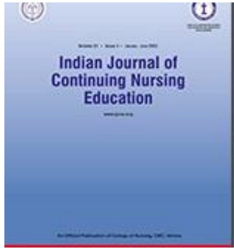
Indian Journal of Continuing Nursing Education